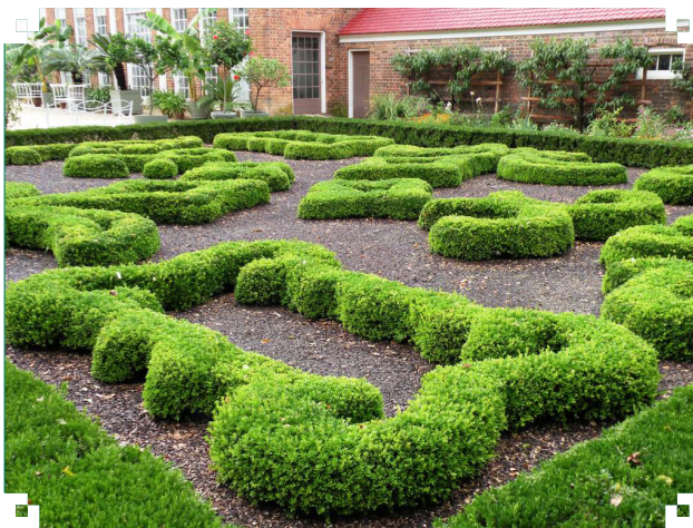
George Washington's Mt. Vernon, VA (Renovated in 2000)

Enlarged view of Stalite PermaTill® rotary-kiln fired expanded slate particle