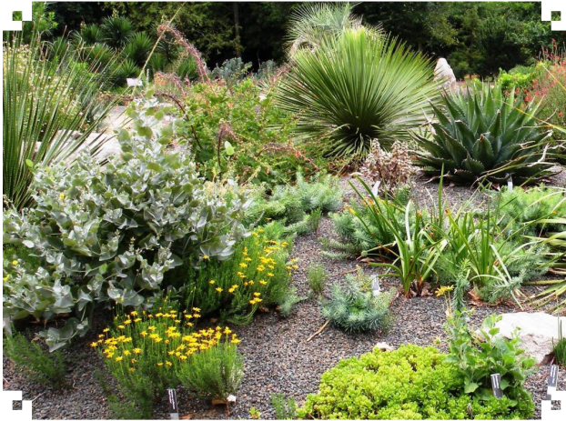
J C Raulston Arboretum • Raleigh, NC (Scree Garden Installed 2006)